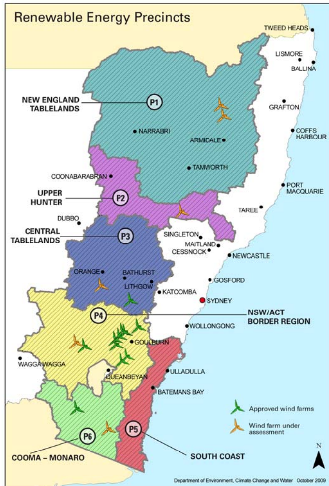
Figure 3.1 Renewable Energy Precincts in NSW